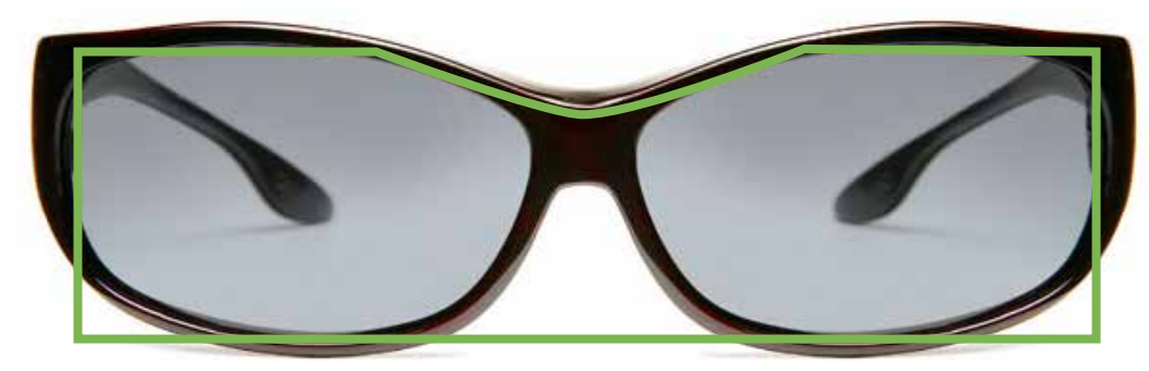
Fits over rectangular or oval prescription glasses no larger than 4-7/8" wide x 1-3/8" high