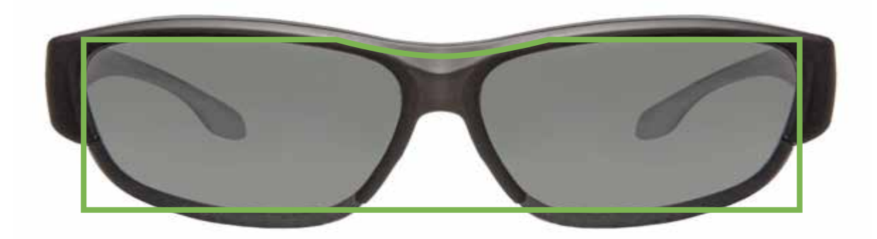
Fits over rectangle or oval prescription glasses no larger than 5-1/4" wide x 1-1/4" high