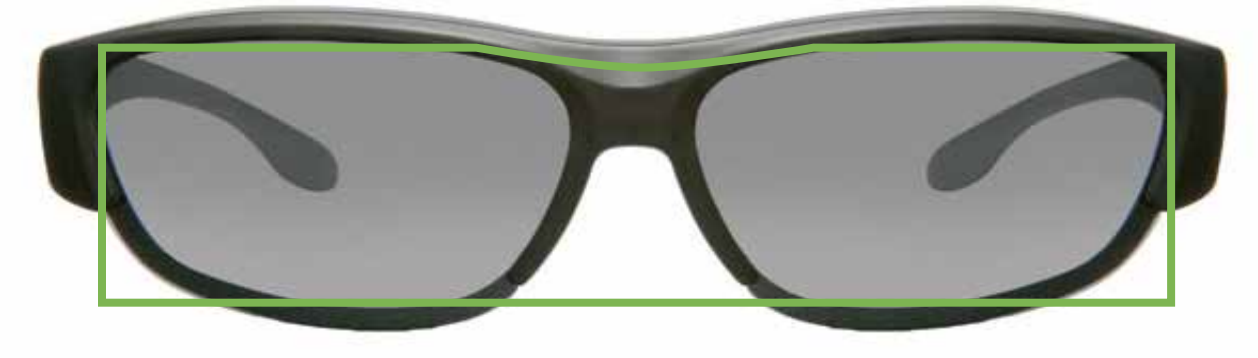
Fits over rectangle or oval prescription glasses no larger than 5-5/8" wide x 1-3/8" high