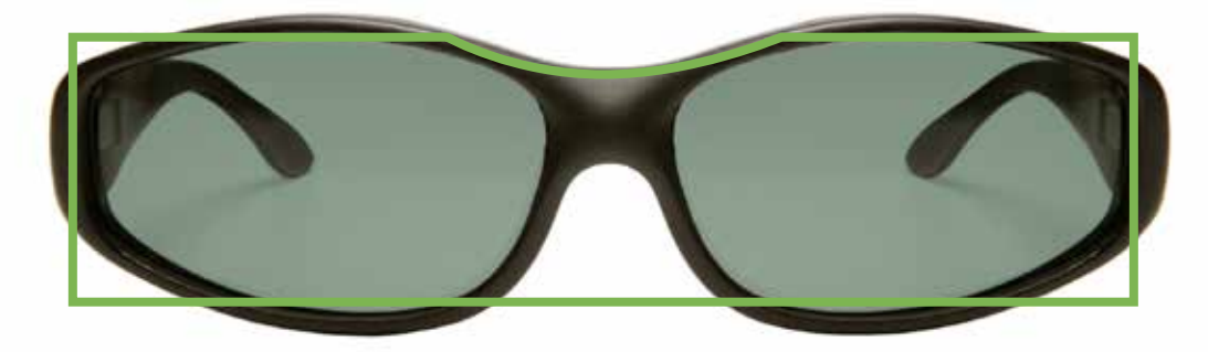
Fits over rectangular or oval prescription glasses no larger than 5" wide and 1 - 1/4" high