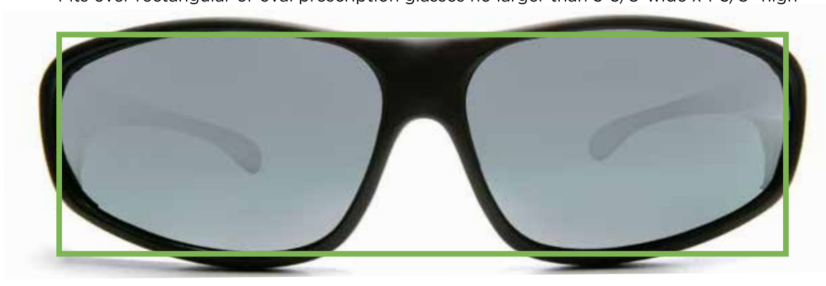
Fits over rectangular or oval prescription glasses no larger than 5-3/8"wide x 1-5/8" high